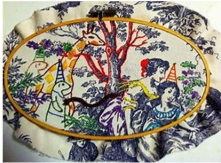
Piece inspired by Richard Saja Historically Inaccurate http://historically-inaccurate.blogspot.com/

Leaves, flower, feathers, and branch are all embroidered with one or two threads on illusion tulle. Once embroidery is completed the items are cut from the illusion and attached to fabric. This is a way to create a light and airy look to give depth to your art design.